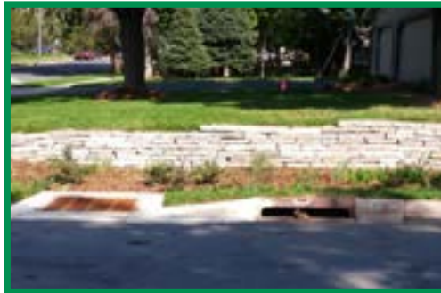
Curb cut with rain garden, Bloomington

Take the Cedar Ave bridge to cross the Minnesota River between sites B & C